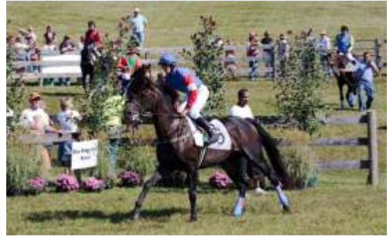
Jockeys in colorful silks leave the paddock for the start of a race.

"What an incredible event for Blue Ridge Hospice!" proclaimed one race-goer.