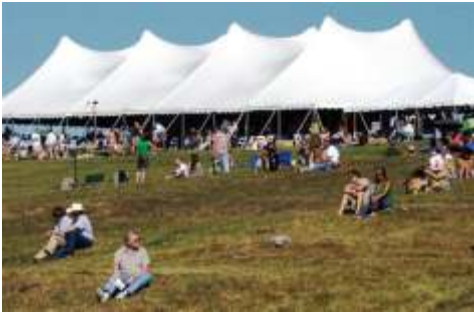
Race-goers enjoyed views of the course from the hillside and corporate tents.